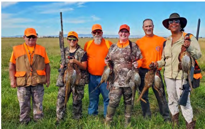
4th Hastings Island Introductory Womens' Hunt

After a safety briefing, everyone met their dog handlers and guides, then headed out into the field in small groups to begin the hunt. After a thrilling and successful day of shooting, everybody enjoyed lunch at the coffee shop while their birds were being cleaned. The afternoon concluded with a round of shooting at the trap range.