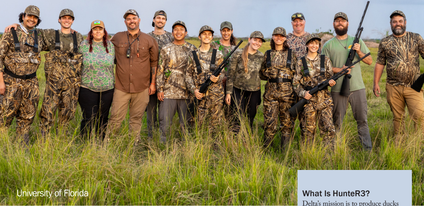
University of Florida